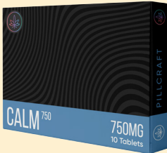
CALM - 750