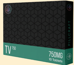
TV - 750